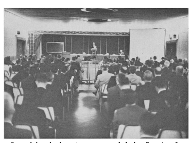
Several hundred registrants attended the Opening Session of the 58th Annual Meeting.